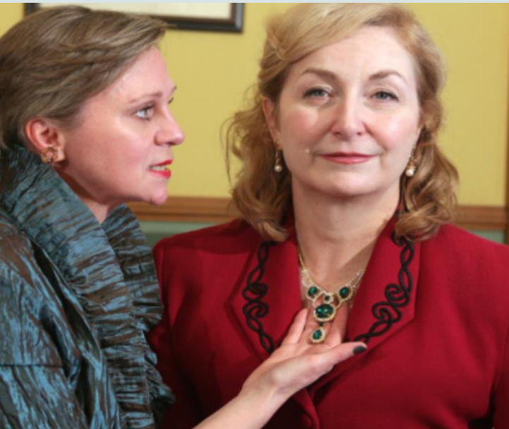
Boston Marriage (Produced & Starred)