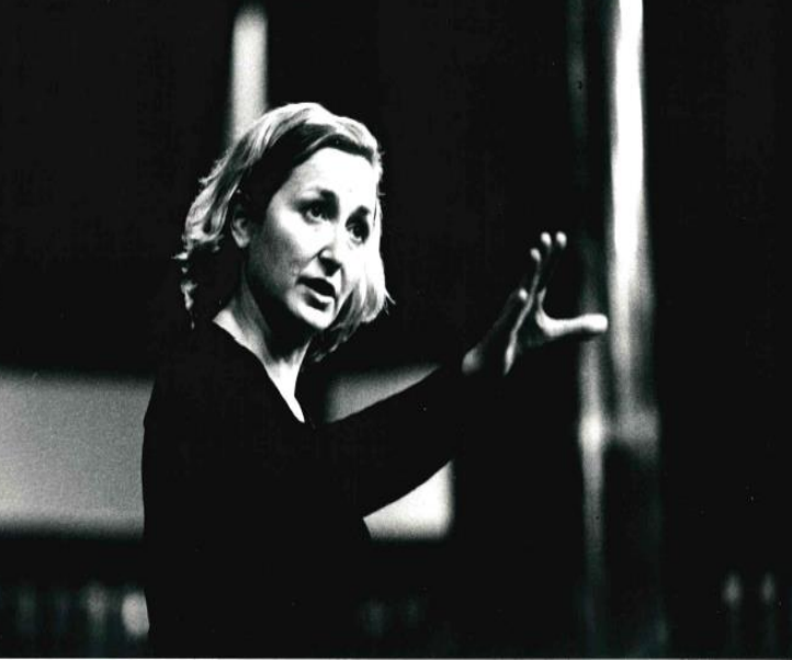
Shakespeare's Globe UK